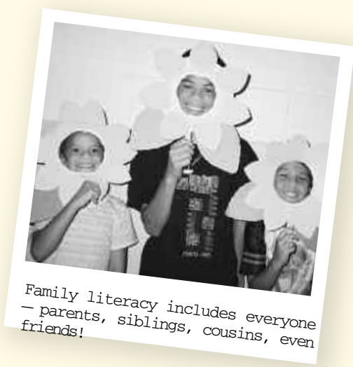
Family literacy includes everyone — parents, siblings, cousins, even friends!