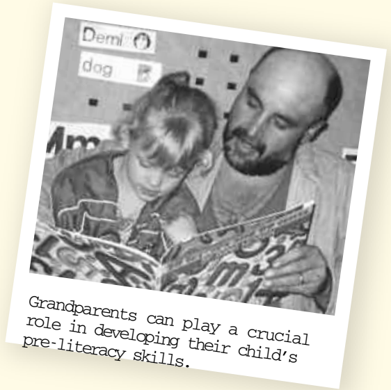
Grandparents can play a crucial role in developing their child's pre-literacy skills.