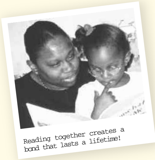
Reading together creates a bond that lasts a lifetime!